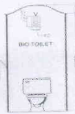
TYP. SECTION OF BIO TOILET